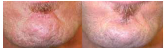
Figure 6: Before (L) and after (R) chin rejuvenation

sites on each side. The projection of the chin can be improved with relaxation of the over-contracting mentalis (Figure 6). The horizontal mental crease can be treated with the injection of two to three units per side just below the mental crease. Too high a dose can interfere with speech and may lead to drooling. The dimply or popply chin can be treated with 5-10 units per side using one to two injections.